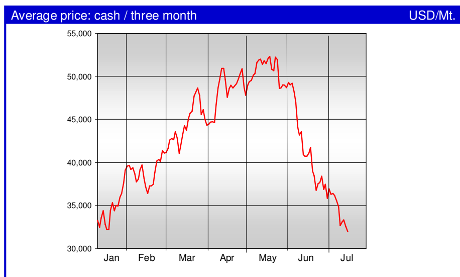
OFFICIAL NICKEL PRICE IN THE L.M.E. (16-July-2007)

This nickel correction, necessary in view of the untenable price levels of the previous months, will have a positive effect in the medium term because it will decrease the stainless steel prices and will stimulate demand.